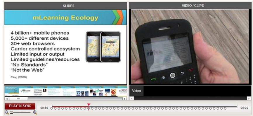
Figure 3 - A multimedia learning management system needs to synchronize the various types of media available for learning

technologies advance. Syncing the two types of media in Knoodle is a cinch, as shown in Figure 3. Once you have a dual panel presentation created it can be exported as a MP4 movie file for off-line and mobile device viewing.