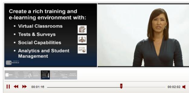
Figure 2 – Integrating words and narration supports multimedia learning.

Based on the above theory and research, what would a learning management system that was supportive of multimedia learning look like? To start, it would ideally have two separate screens to present material in visual and verbal modalities. In order to increase attention and engagement, one of the two screens would ideally show video of a person as a teacher, or an animation that illustrated a particular process or procedure. But, it also would need the flexibility of instructors being able to use a single screen, switching to a dual screen mode as needed, while making sure that words and pictures are physically and temporally integrated (See Figure 2).